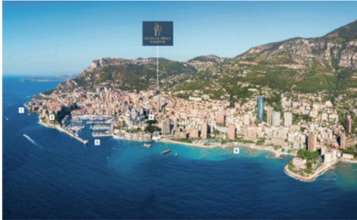
1 Port and business district of Fontvieille | 2 The Rock and the Prince's Palace | 3 Port Hercules | 4 The Place du Casino and the Opéra Garnier | 5 Lanette Beach