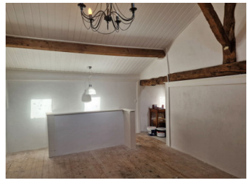
NERGY - DPF