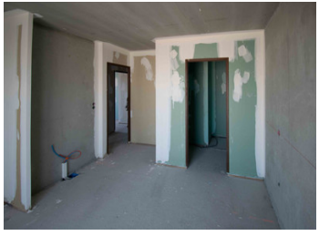
FNFRGY - DPF