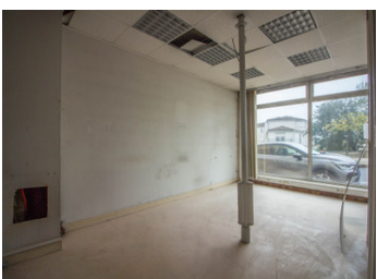
ENERGY - DPE