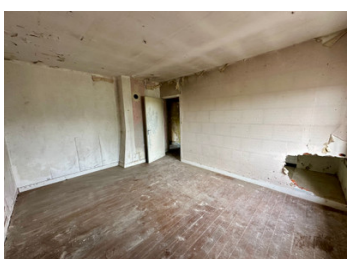
ENERGY - DPE