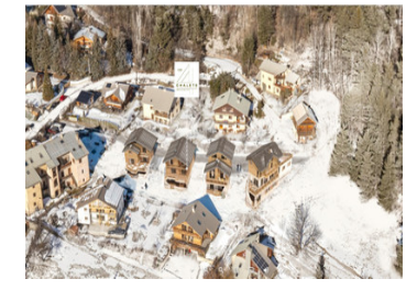
ENERGY - DPE