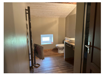
ENERGY - DPE