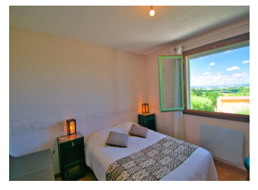
ENERGY - DPE