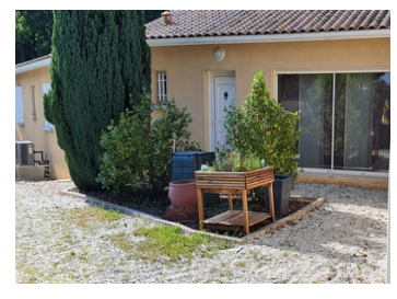
FNFRGY - DPF