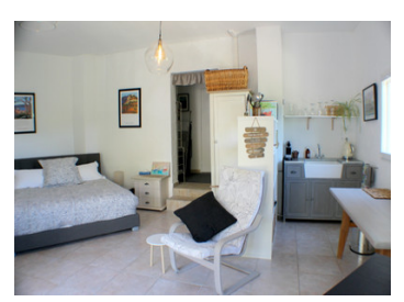
ENERGY - DPE