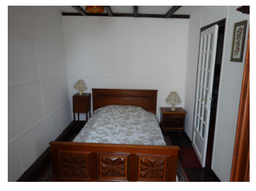
FNFRGY - DPF