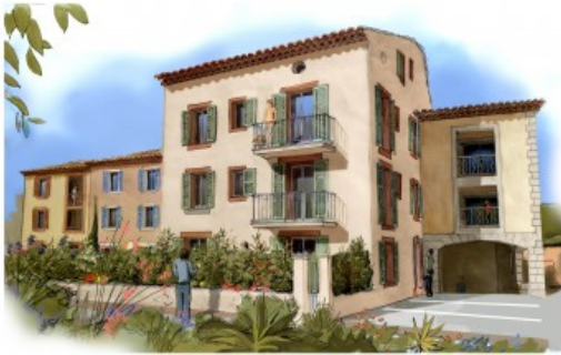
“ LE CALENDAL ”