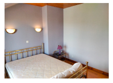
FNFRGY - DPF