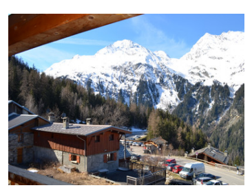
FNFRGY - DPF