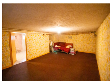
FNFRGY - DPF