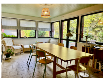
ENERGY - DPE