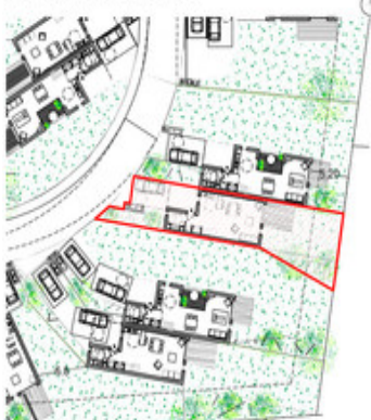
LOCALISATION - PLAN DE REPERAGE