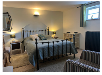
FNFRGY - DPF