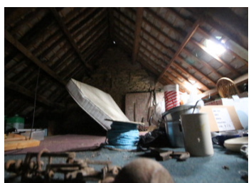
ENERGY - DPE